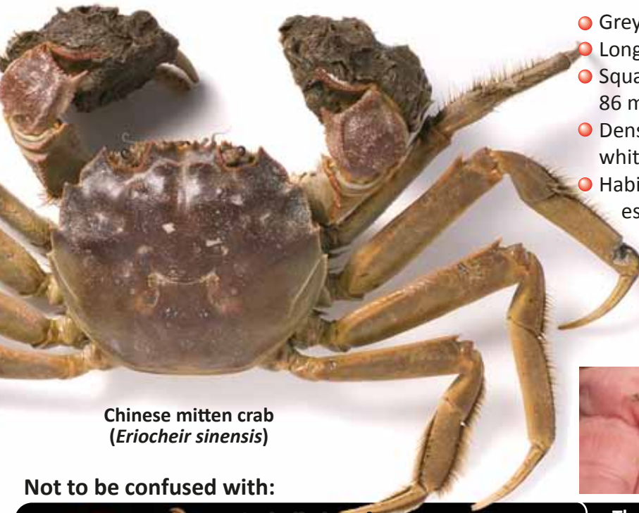
Chinese mitten crab ( Eriocheir sinensis )