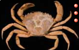
Common shore crab ( Carcinus maenas )